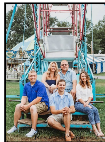
Juniata County Fair, Port Royal

Blue color designates location or person as a Juniata River Valley Chamber of Commerce member.