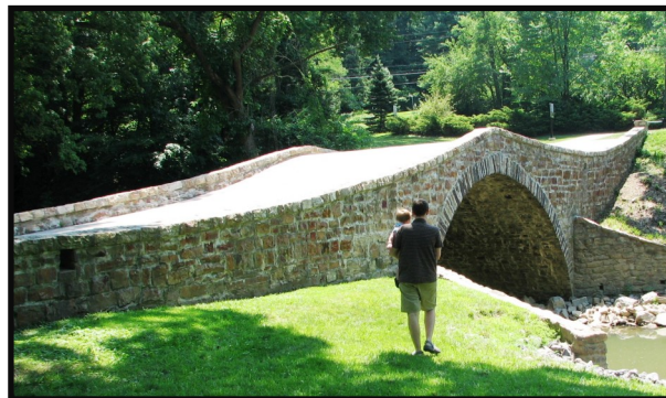
Stone Arch Bridge