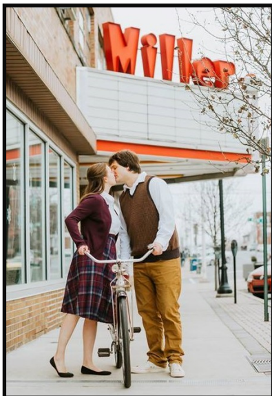
Miller marquee, Lewistown