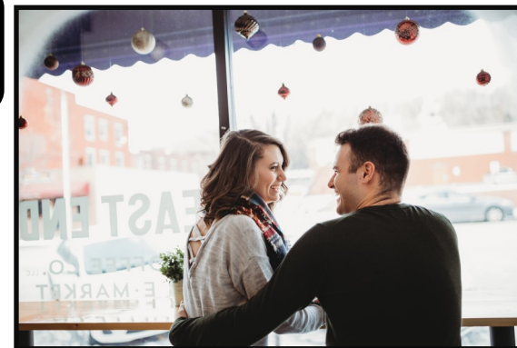
East End Coffee Co., Lewistown