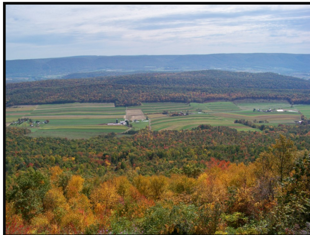
Jack's Mountain overlook