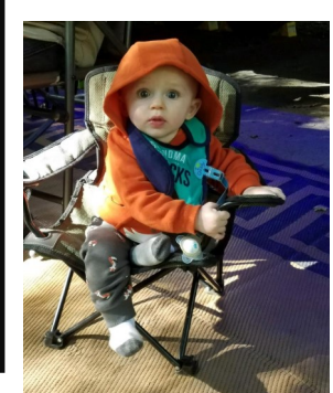
Victory Park, Lewistown

Route 322, then turn right onto William Penn Highway.