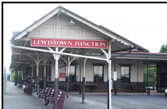
Lewistown Train Station

Lewistown Train Station - 150 Helen St., Lewistown, 17044. The oldest surviving structure known to have been built by the Pennsylvania Railroad and is home to the extensive collections of the Pennsylvania Railroad Technical & Historical Society. (Guests will be required to sign a waiver prior to tour.)