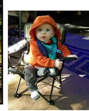
Victory Park, Lewistown

Route 322, then turn right onto William Penn Highway.