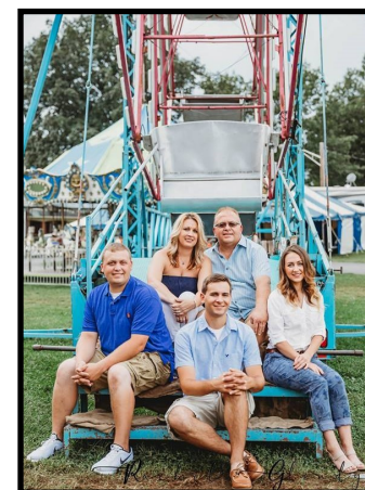
Juniata County Fair, Port Royal