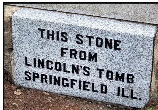
The Lincoln Stone