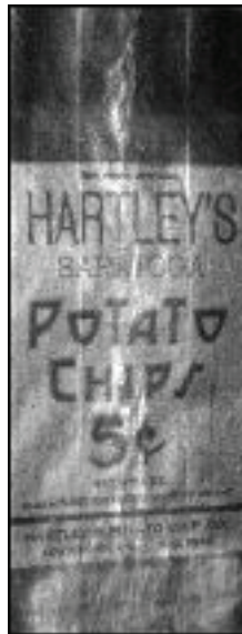
Exhibit items of special interest: Hartley's Potato Chips, 5 cents, circa 1935. An artifact of this still popular Mifflin County business, the chip bag can be seen in the Kitchen. (at left)