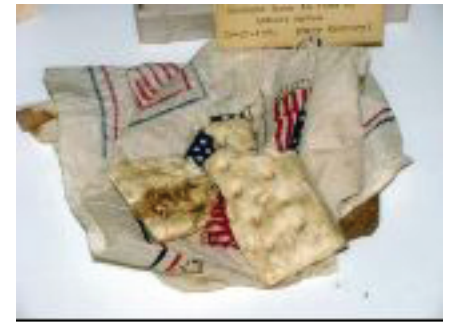
Believe it or not! See original Civil War Hardtack - This Union soldier's daily ration, was brought home to Mifflin County in 1868. It is over 135 years old and on display in the Military Room.

The "water closet" was flushed by pulling a chain. This, in turn, allowed the water from the oak copper-lined tank overhead to rush into the large porcelain bowl. When you visit McCoy House in